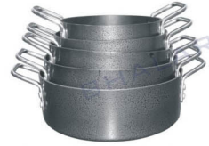
ALUMINIUM BRAZIERS HARD ANODIZES