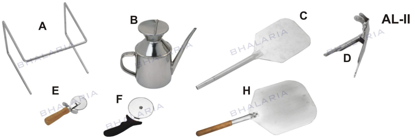
A) Pizza Tray Wire Stand St. Steel B) Oil Can C) Pizza Peel 7" X 9" Blade 21" Long Aluminium