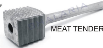
MEAT TENDERIZER HOLLOW