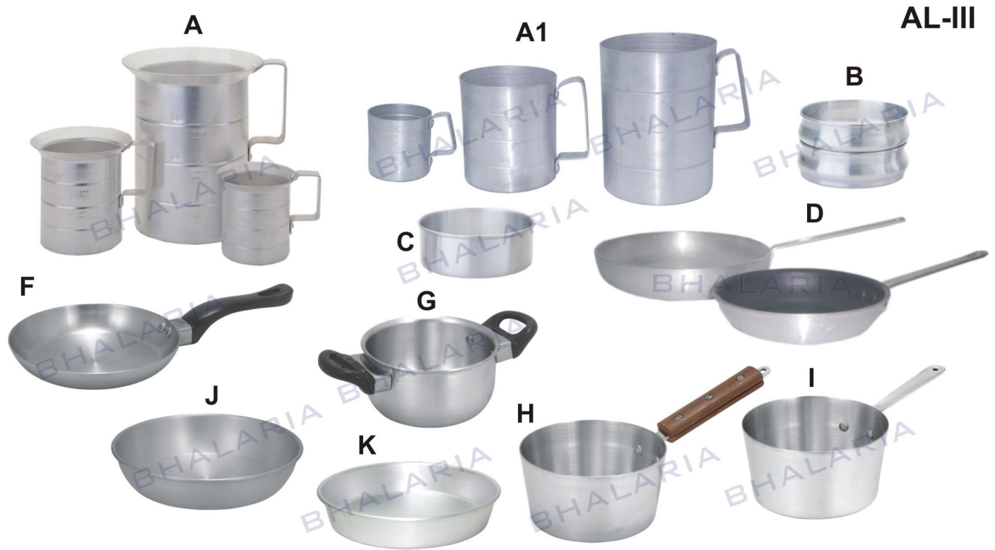
A) Aluminium Measurers 1/2, 1, 2, 4 Qt A1) Dry Measures 1/2, 1, 2 & 4 Qt B) Dough Retarding / Proofing Pans C) Deep Straight Pan 8" X 2", 8" X 3", 10" X 2", 10" X 3", 12" X 2", 12" X 3"