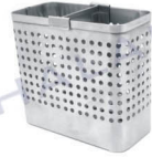
RECTANGULAR CUTTER BIN