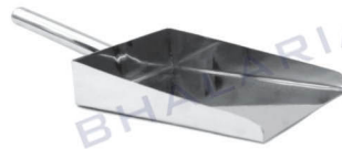
CHIP SCOOP LARGE HEAVY